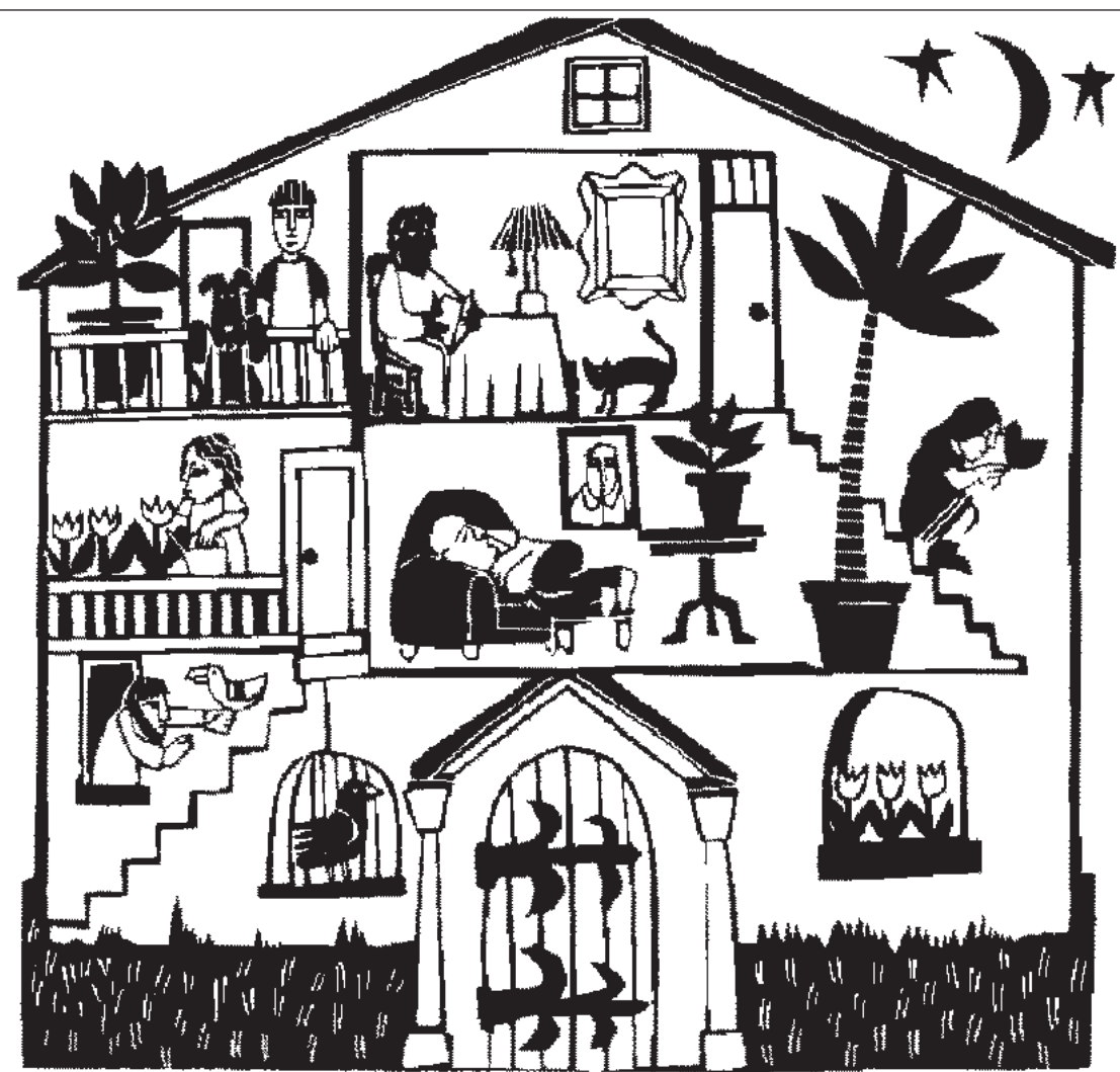
"There are many rooms in my Father's house" John 14:2