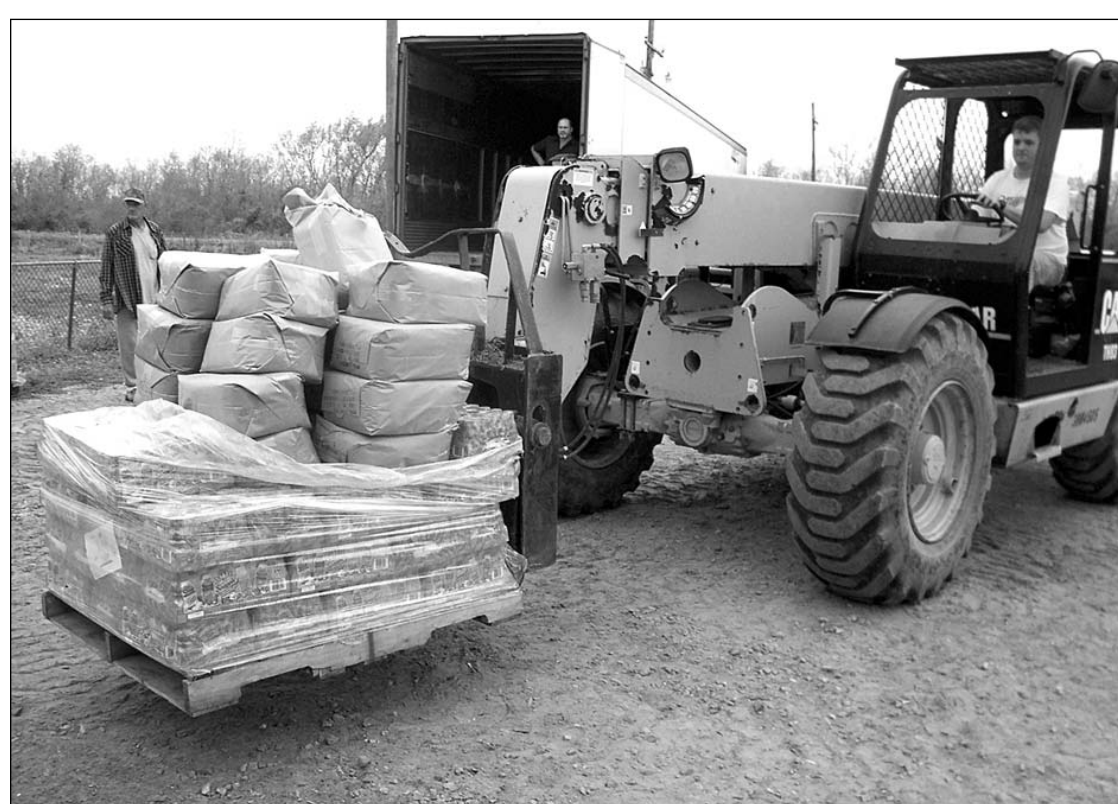
Food supplies are unloaded Thursday, March 16, at St. Patrick Chapel in Sweetlake. The supplies are available for those in need following the devastation of Hurricane Rita and the current rebuilding efforts throughout Southwest Louisiana.