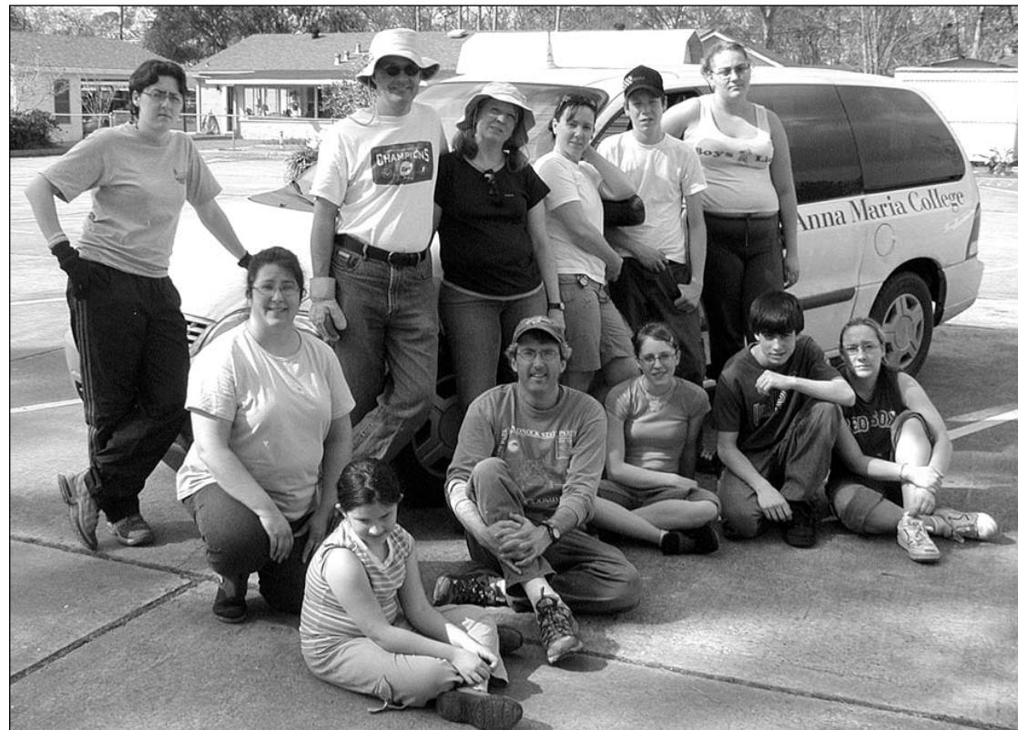
Some of the students, staff, faculty and children of faculty and staff from Anna Maria College in Paxton, Mass., who visited Lake Charles in early March take a break from their labors in helping cleanup around Our Lady Queen of Heaven Church.