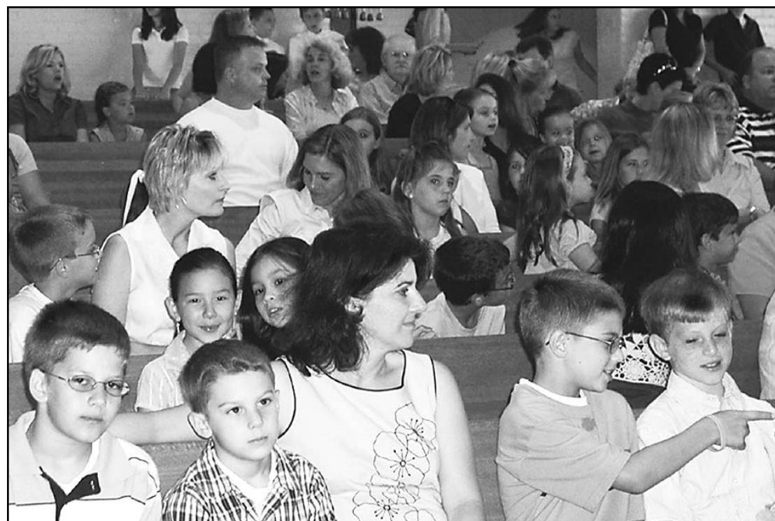
Students and parents await the beginning of the Our Lady Queen of Heaven End of Year prayer service that concluded the 2005-2006 academic year on Friday, May 26.