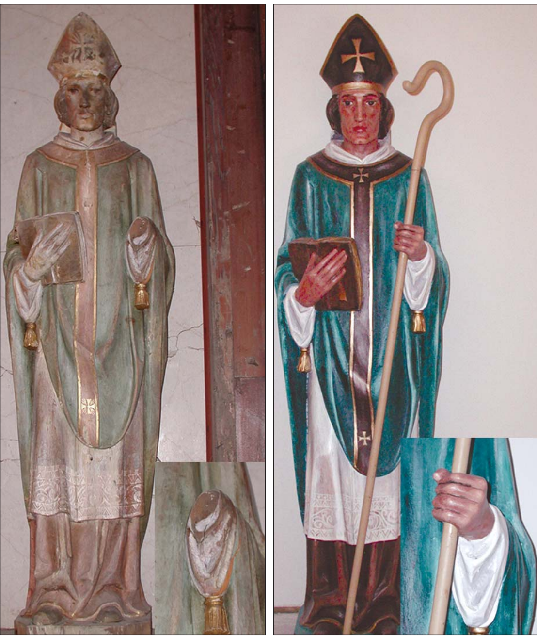
The photos above provide stark contrast of what the statue of St. Eugene looked before the refurbishing, left, and its appearance after the work was done, right.