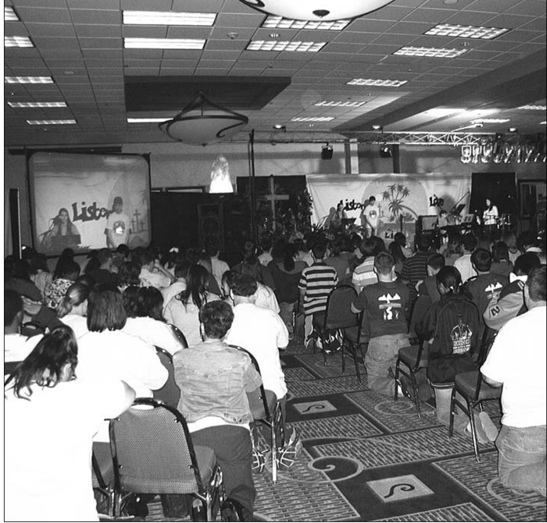
Throughout the weekend of the Diocesan Youth Conference, attendees prayed the Rosary a decade at a time. More than 300 people, including 215 eighth through 12th grade students attended the annual event, which is sponsored by the Office of Youth Ministry of the Diocese of Lake Charles.