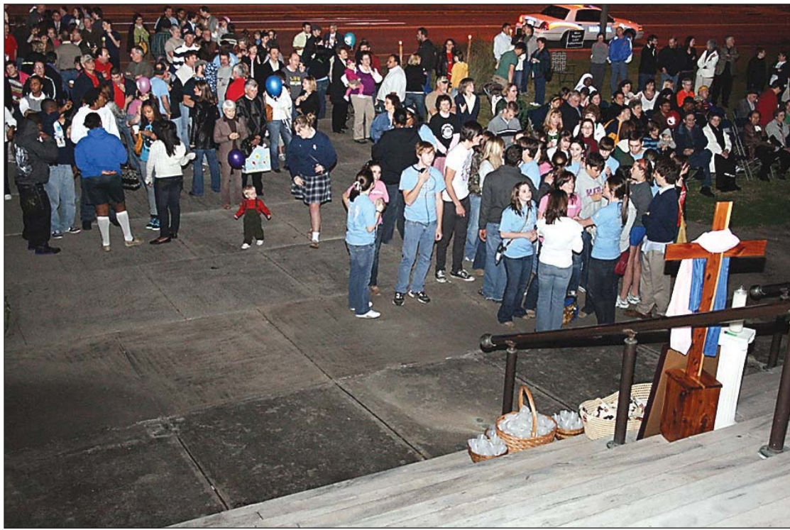
A large crowd of supporters took part in last year's pro-life rally held at the Calcasieu Parish Courthouse and the Cathedral of the Immaculate Conception. This year's "Rally for Life" is expected to draw even larger attendance.