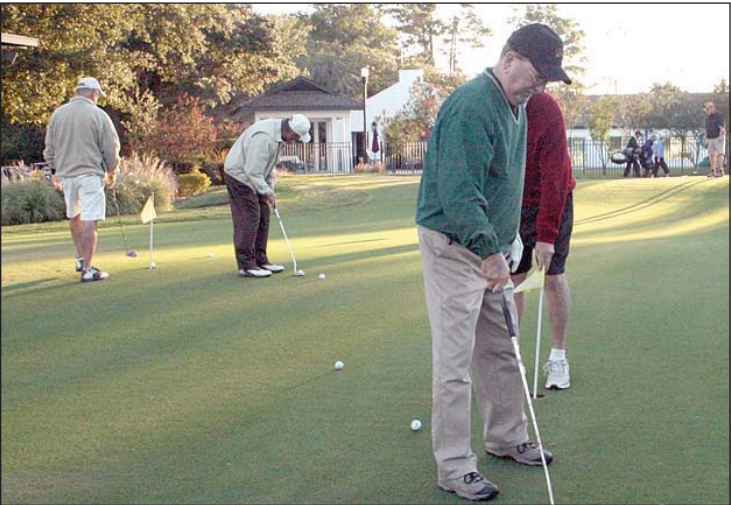
Golfers warm up on the putting green before the morning round of the 2010 Bishop’s Golf Classic at the Lake Charles Country Club. Deadline to enter the 2011 tournament is Friday, Sept. 30.

O’Charley’s Restaurant of Lake Charles will provide lunch and refreshments on the course is courtesy of Iberia Bank.