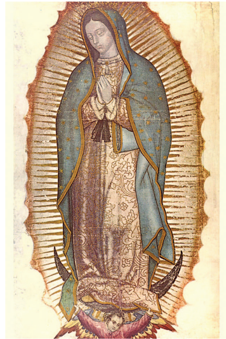
Our Lady of Guadalupe

Participation in this wonderful event provides for the continuation of the production and airing of the Glad Tidings television program each Sunday morning on KPLC-TV. The preparation and publication of the Catholic Calendar in five regional newspapers is made possible by attendance at the Gala. The website of the Diocese - ldiocese.org - is maintained as well as continually upgraded through the purchase of a Gala ticket or table. The broadcast of the 9:30 a.m. Mass each Sunday from the Cathedral of the Immaculate Conception on two local radio stations is also made possible, in part, by participation in this gala evening.