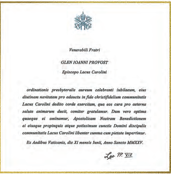
A translation of the original Latin text above, sent by His Holiness Pope Leo XIV, is as follows: